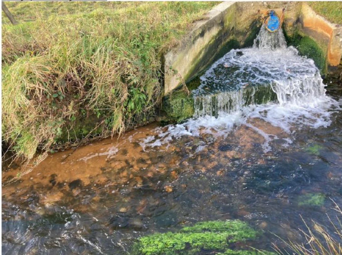
Photograph 5 Discharge 26/11/21

Ever since the site changed production to focus on whey processing, particularly to produce powder used in baby milk and other products, the effluent being discharged into the River Inny has been more challenging to treat. This has resulted in unacceptable pollution of the local river, which is a tributary of the River Tamar, causing significant harm to fish and other aquatic wildlife. Another issue has been foul odours which have often affected the lives of local residents.